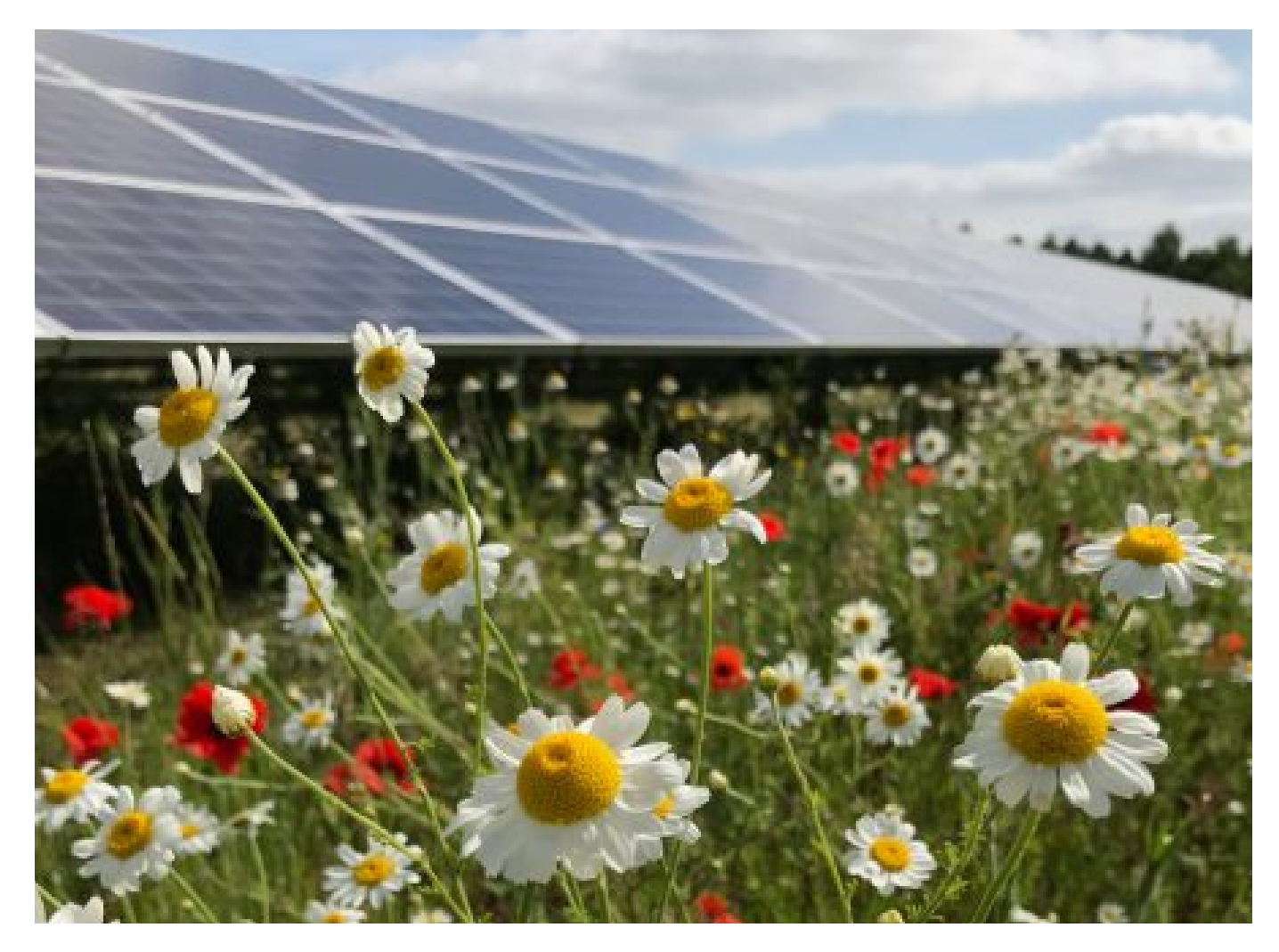
Solar farms can create extensive new habitats for pollinators

More information on the contribution solar energy makes to the natural world is available in Solar Energy UK's Natural Capital Value of Solar report, and in light of the new BNG requirements introduced in the Environmental Bill, the industry is also developing an extensive guide on natural capital best practice.<sup>21</sup> This will help developers to deliver high-quality land management programmes on solar farms around the country. This best practice guide will be published in Spring 2022.