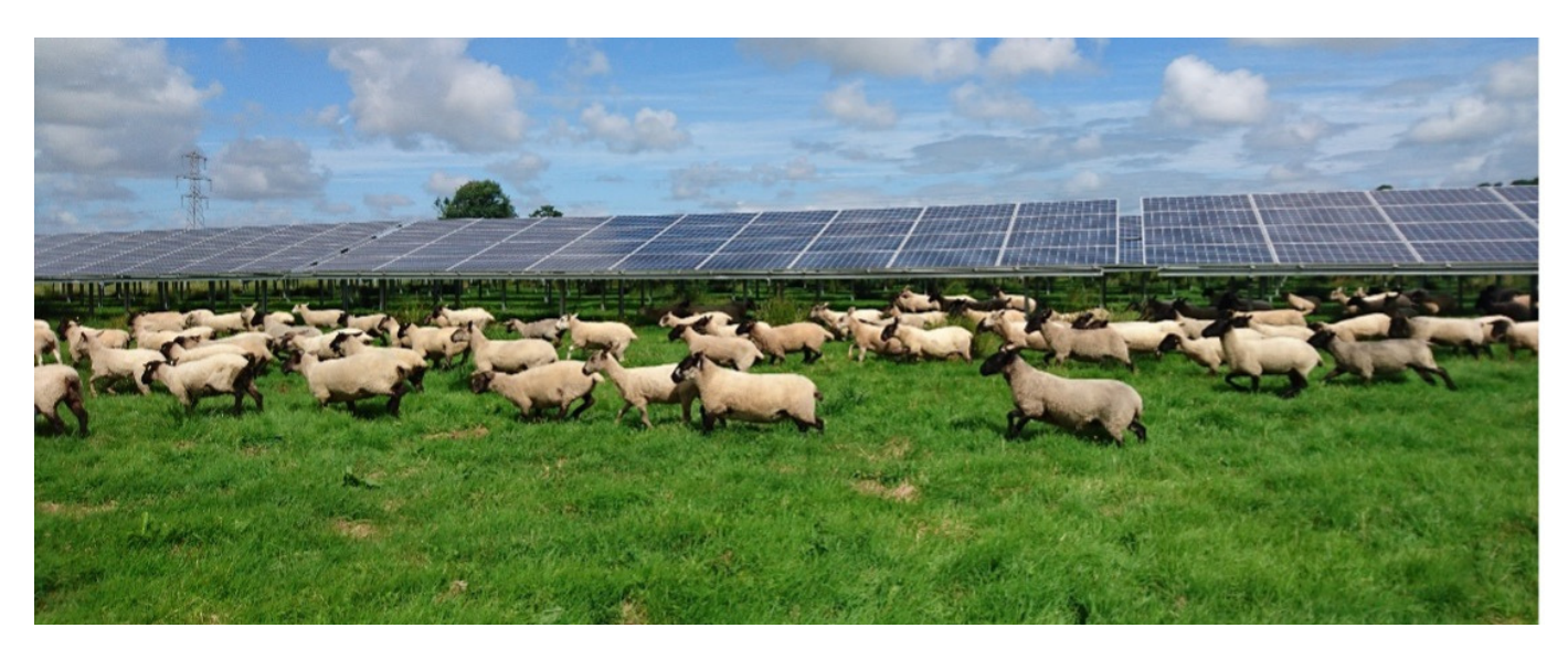
Some solar projects connect with local farmers, using sheep to control vegetation growth

The solar industry is committed to supporting sustainable countryside development and is working with farming groups to develop guidelines for other dual use techniques of solar landscapes. These include, for example, collaborating with farmers and landowners to manage grasslands around solar farms through grazing sheep.